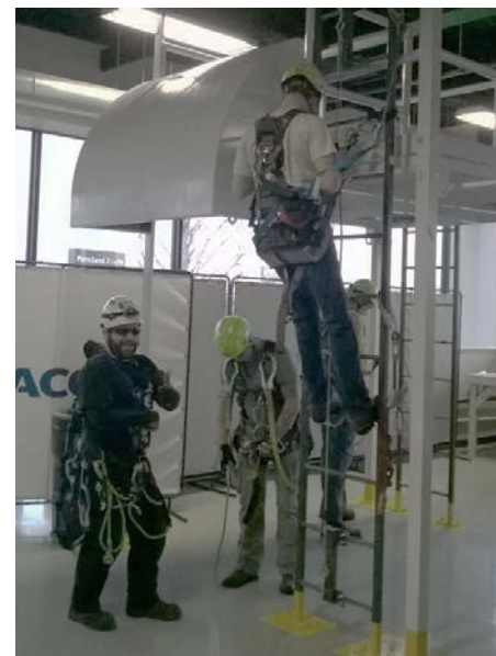
Students practicing safe tie off in the indoor lab, PCI-North Kansas City Satellite Location

The course provides an introduction to the tower industry and job logistics including site conditions, RF radiation awareness, Personal Protective Equipment (PPE); antenna mounts, microwave equipment, tower lighting systems, ground systems, Tower Mounted Equipment (TME); platform, electrical, equipment safety, and basic welding and exothermic concepts.