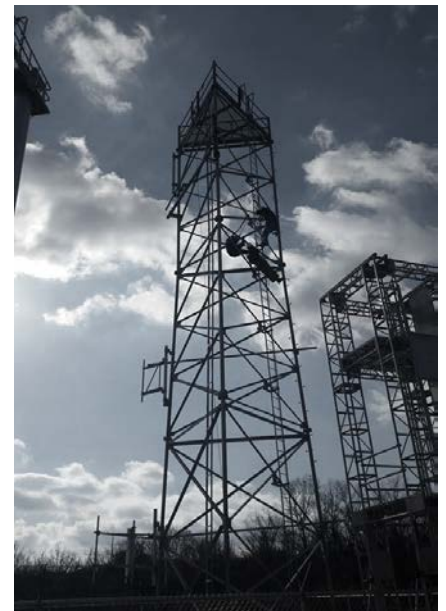
Outdoor Tower Lab, Kansas Citv. MO