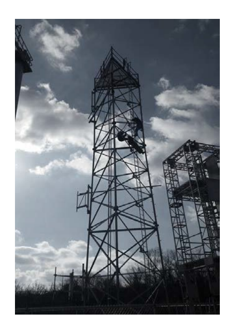
Outdoor Tower Lab, Kansas City, MO