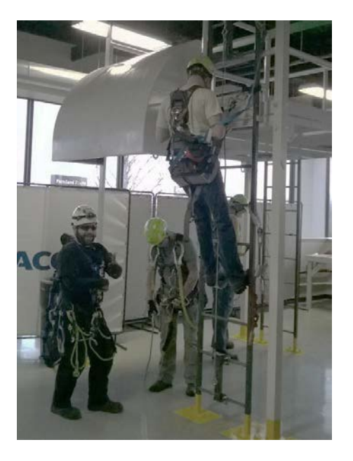
Students practicing safe tie off in the indoor lab, PCI-North Kansas City Satellite Location

This course covers fundamental electrical topics for the trades including current, voltage, resistance, power, Ohm's law, electrical test equipment, resistive circuits, reactive circuits, transformers, and calculations related to electrical circuits, electrical safety, and practical application for the trades.